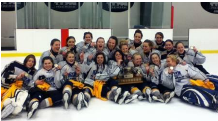
Kings County Kings Midget Female Atlantic Champions

The Kings County Kings Midget Female team rewrote hockey history on PEI. The Kings recently captured the first Midget Female Atlantic Hockey Championship for PEI and will now represent the Atlantic region at the Esso Cup, National Female Midget Championships in St. Albert, Alberta.