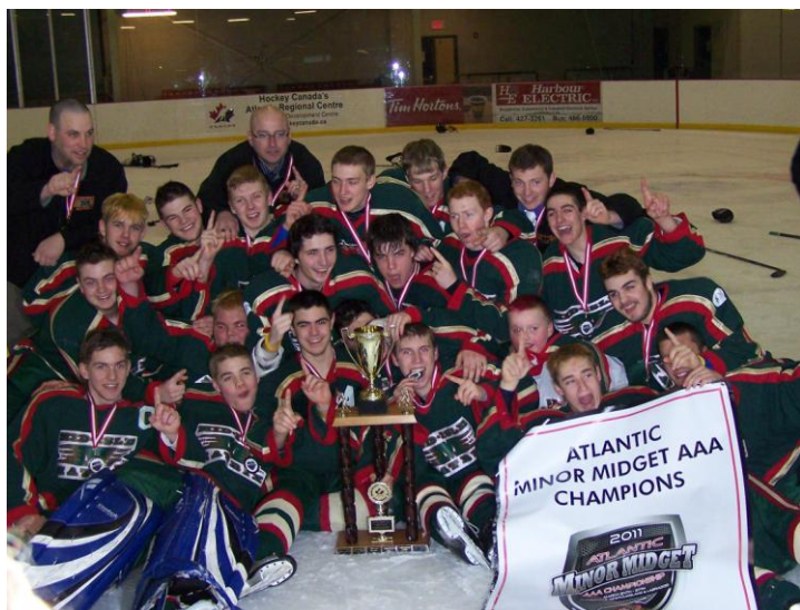
Mid Isle Matrix Atlantic Minor Midget Champions