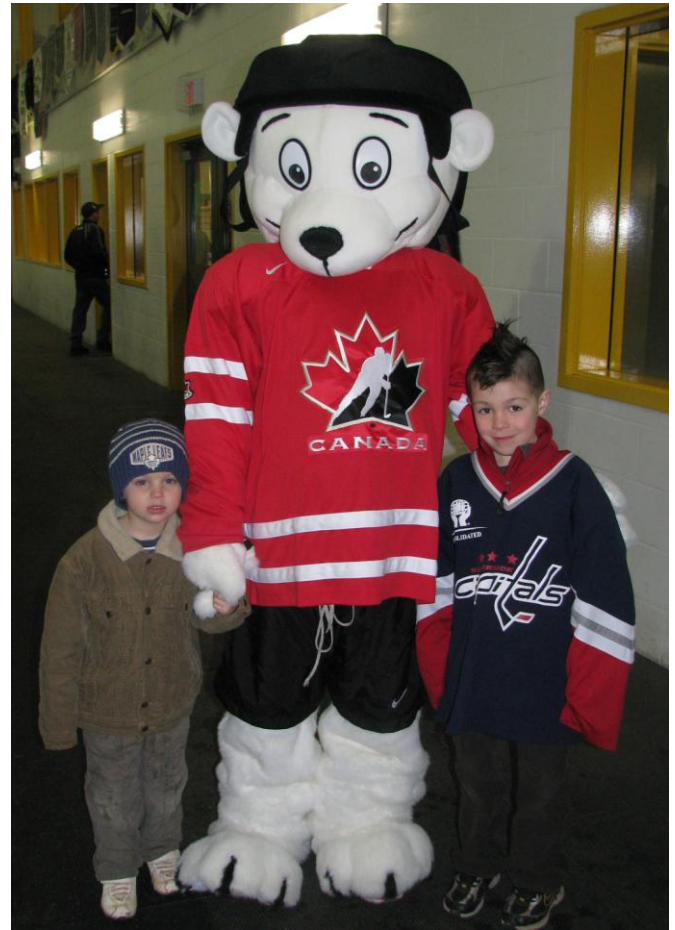
Puckster visited several Island rinks during the provincial championships. This photo was taken at the Atom AAA Provincials in Tignish.

For more information on the 2011 International Coaches Conference, please visit www.hockeycanada.ca/icc