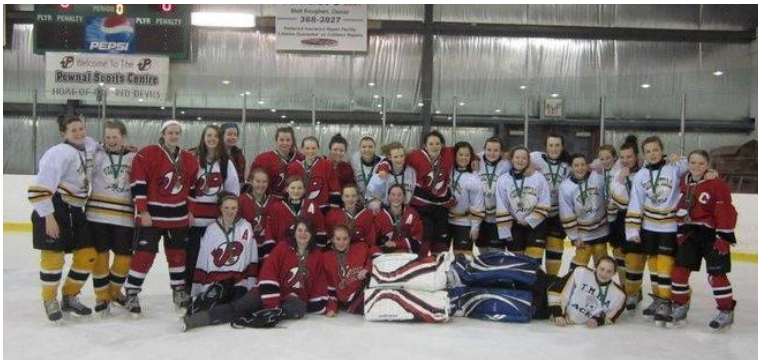
Pownal Red Devils and Tignish Aces

All teams compete hard trying to capture a provincial title. At the Bantam A female championships, the host team Pownal Red Devils defeated the Tignish Aces to capture the championship. Although there is officially only one championship team, both teams can still be considered winners.