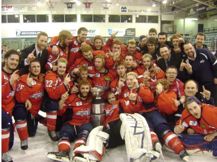
Summerside Junior "A" Capitals 2011 Kent Cup Champions

The Summerside Western Capitals claimed their second Maritime Hockey League championship in three years. The team also captured the Kent Cup in 2009. The Capitals secured the title with a dramatic come-from-behind road victory to sweep the Pictou County Weeks Crushers in the best-of-seven MHL series.